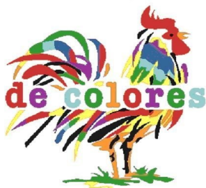
Wasatch Front Walk to Emmaus

The Walk to Emmaus is a spiritual renewal program intended to strengthen the local church through the development of Christian disciples and leaders.