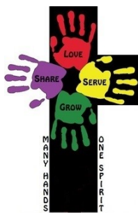
Disciples of Christ

Emmaus is open to members of any Christian denomination. Emmaus is for the development of Christian leaders who: